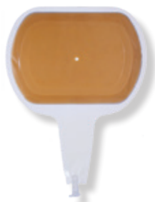
Extra-large eakin Wound Pouch™ 839263