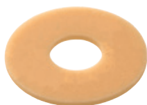
eakin Cohesive SLIMS® 839005