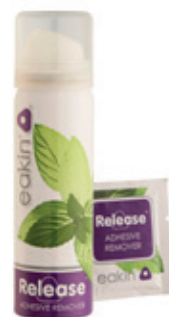
eakin release™ spray & wipes 839023 / 839024