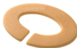
eakin Cohesive StomaWrap™ 839006