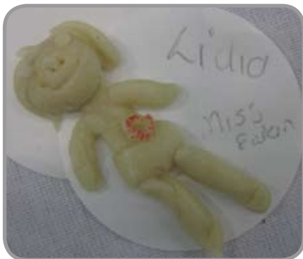
The winning entry 'Miss Eakin'

At the recent SASA Congress in South Africa TG Eakin Ltd ran a 'Mould a Seal' competition where the nurses were asked to mould something using Eakin Cohesive® Seals, demonstrating their unique flexibility and mouldability.