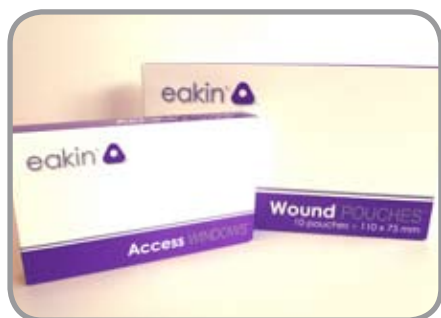
New Wound Pouch branding

In November 2011 the Eakin Wound Pouch range will be rebranding to the fresh new purple and white design across cartons, lids, pack inserts and brochures. The quality of the cartons will remain exactly the same, with the stronger cardboard still being used for the XL and XXL pouches.