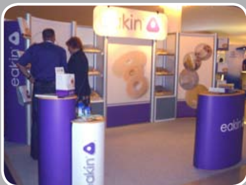
New Exhibition material