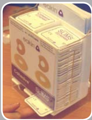
New Cohesive® Counter Displays